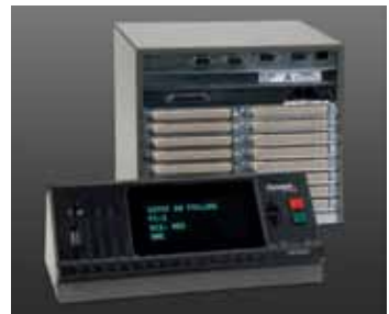
NX Hipot + 64 - 1024 test points