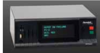
NX Hipot 64 - 128 test points